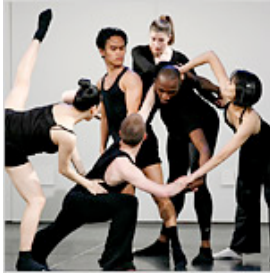
A Five-Day Banquet of Science and Its Meanings