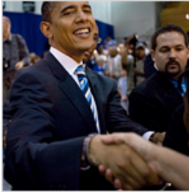
Obama, Awaiting a New Title, Hones His Image