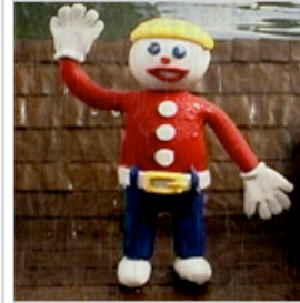
Mr. Bill Returns (in One Piece) to Pitch Debit Card