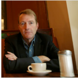
Creating a Don Quixote of the Cheap Motel Circuit