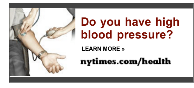
MOST POPULAR - HEALTH

BMI Calculator What's your score? » Calorie Calculator for Goal Weight What's your limit? »